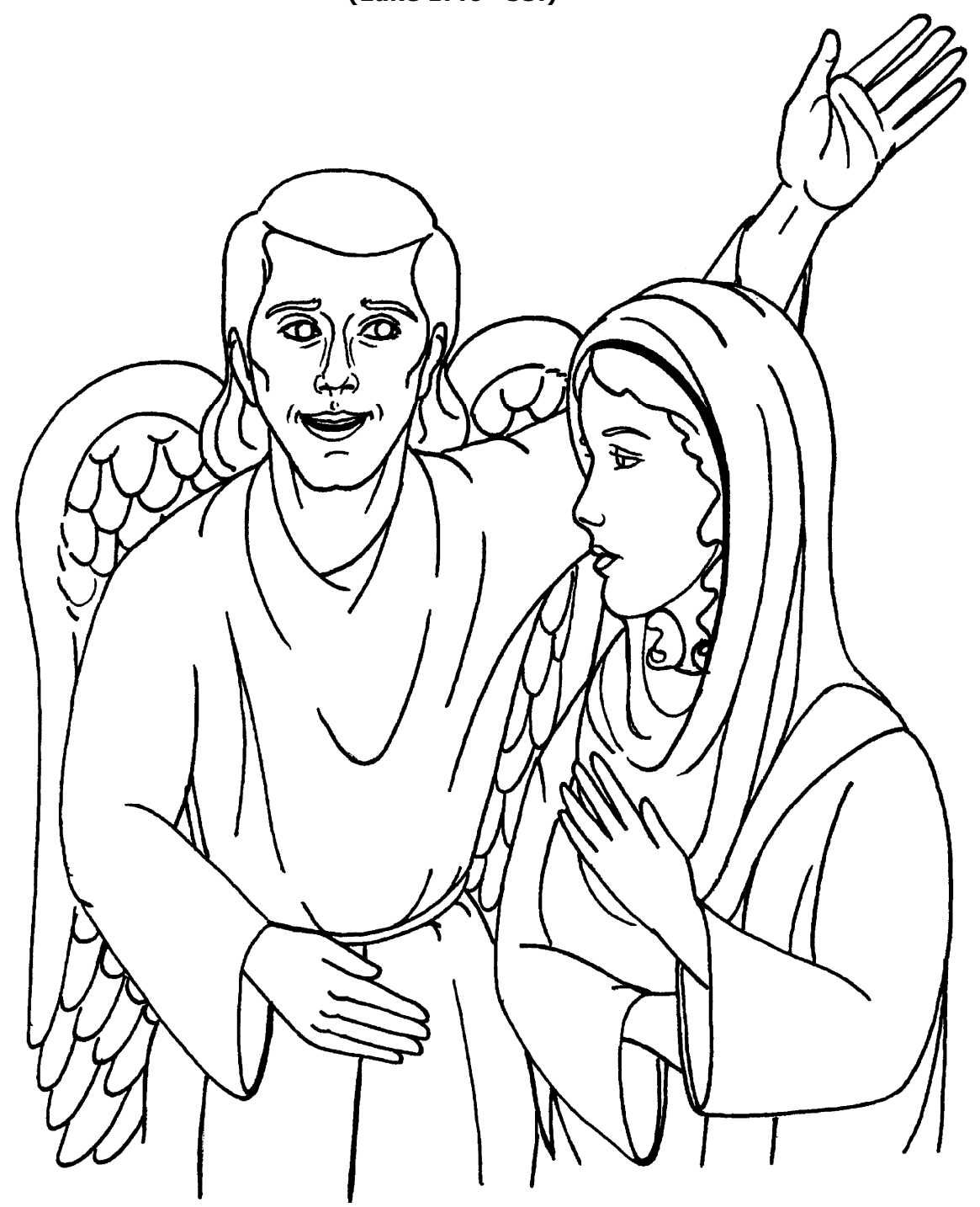
"My soul doth magnify the Lord, and my spirit hath rejoiced in God my Saviour" (Luke 1:46—47 KJV).